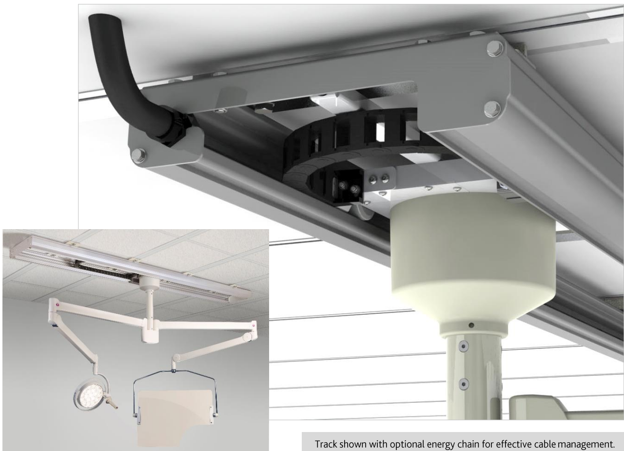
Track shown with optional energy chain for effective cable management. #3001/TC/250/EC for 2.5m track. #3001/TC/420/EC for 4.2m track.

The Kenex range of aluminium ceiling tracks provide strong and easy to install systems for suspending radiation shields, surgical lights and other suspended medical equipment.