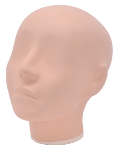
Optional parts: Adjustable head supporter