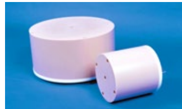
A set with different type of tissue substitute can be custom-ordered