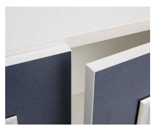
High-velocity heated air flow adheres edge banding to cabinet without seams or glue lines

Where wood or metal construction falls short, AireCore rises to the challenges of healthcare-appropriate storage