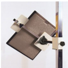
Image Receptor Obliqued at Angle