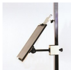
Image Receptor Tilted Backwards