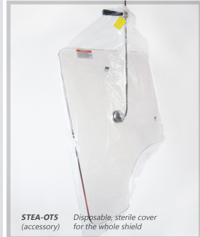
STEA-OT5 (accessory) Disposable, sterile cover for the whole shield