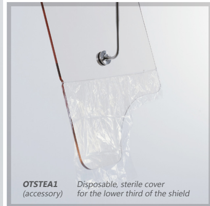
OTSTE1 (accessory) Disposable, sterile cover for the lower third of the shield

Article Codes: OT50001 OT90001 E-OT25B05