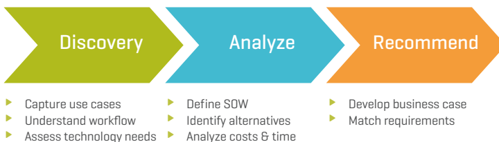
Figure 2 - a high level architecture diagram describing the functions of BridgeHead's HealthStore

Our team of experts can work with you to determine what and how best to archive and consolidate your data. Whether it's medical images, patient medical records, financial statements or human resource information, we can help recommend a strategy that's right for your organization.